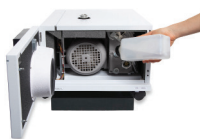
Easy access to pump, with a removable oil tray